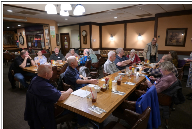
This is the group during the Social Hour which was from 6 pm to 7 pm