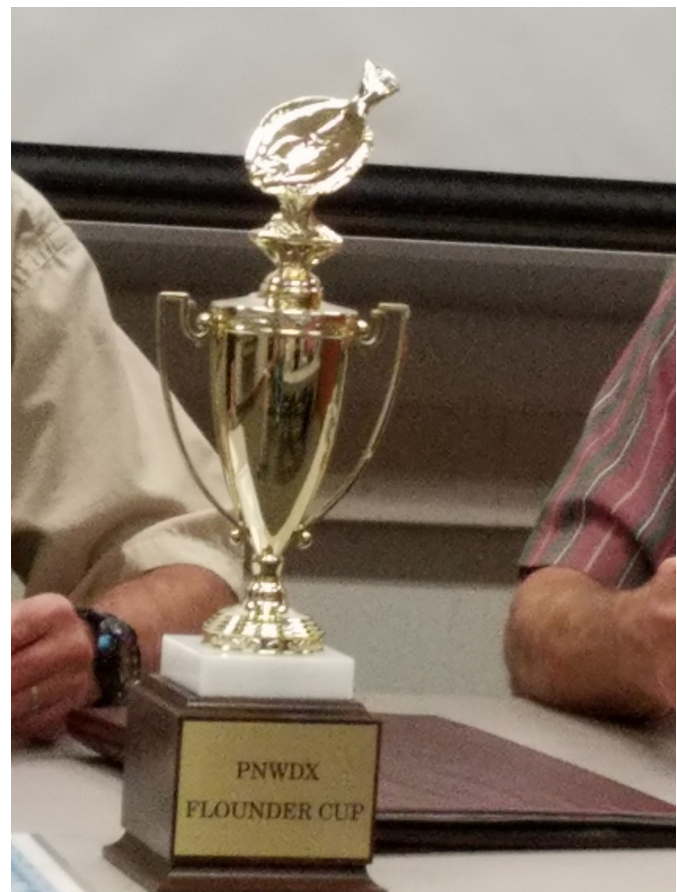
Figure 1: The Flounder Cup resides on the SDXA head table at the September 2019 meeting.

The winner of the 2018-2019 Flounder Cup, Total Score Category was SDXA with 3,743,123 points vs 2,288,688 for IDXA. The Cup was presented at the regular SDXA meeting September 5, 2019.